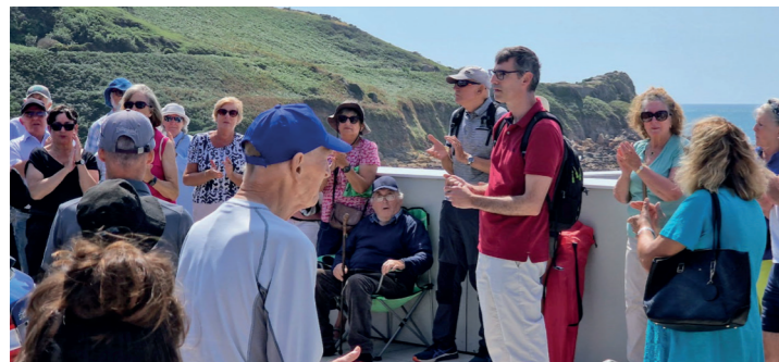
Deputy Tadier addresses the crowd at La Pulente, July 2024.